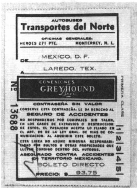
COMMISSION EXHIBIT No. 2485