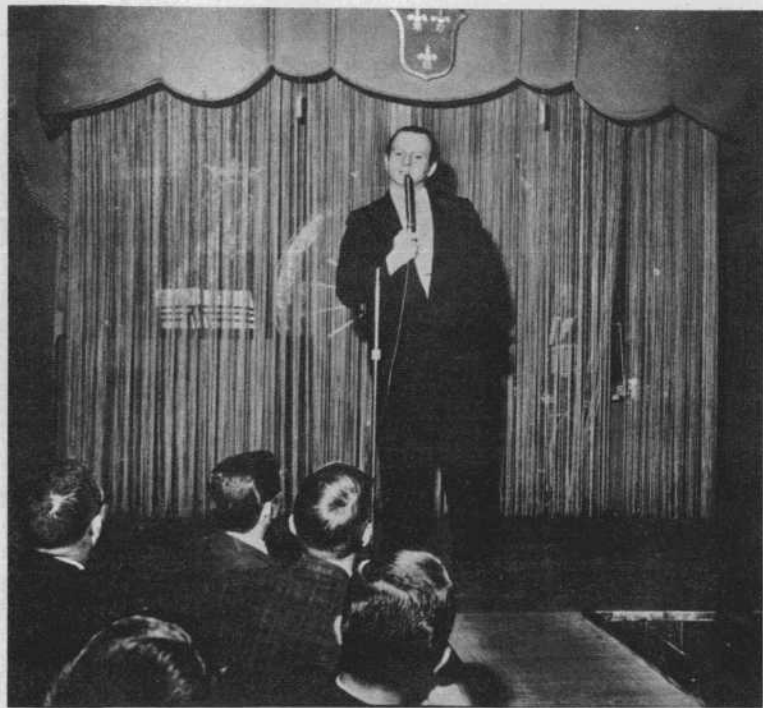
COMMISSION EXHIBIT No. 2425