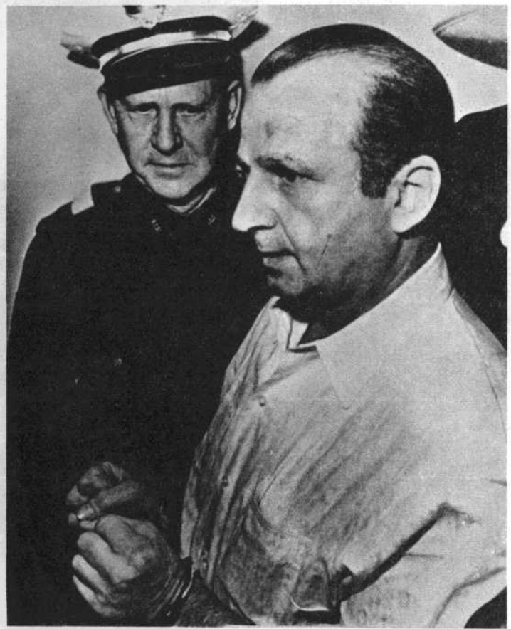
COMMISSION EXHIBIT No. 2422