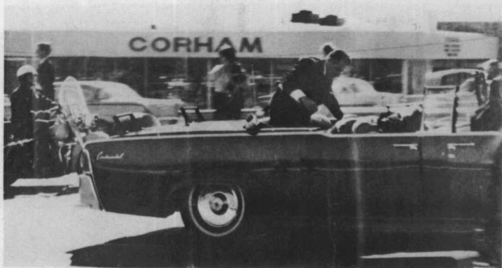
YARBOROUGH EXHIBIT A