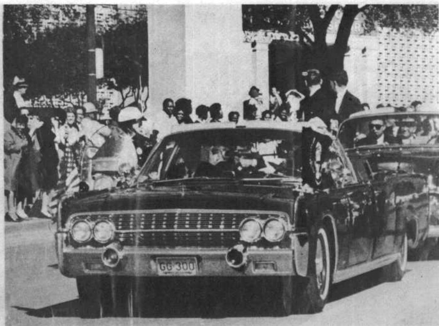
One hundred yards more and they would have reached the