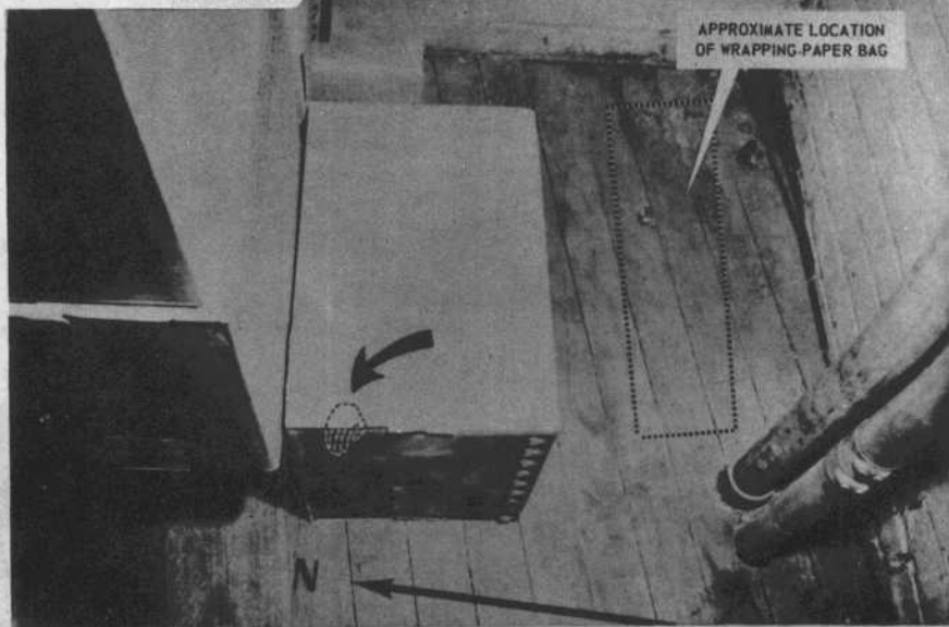
33. APPROXIMATE LOCATION OF WRAPPING-PAPER BAG AND LOCATION OF PALM PRINT ON CARTON NEAR WINDOW IN SOUTHEAST CORNER. (HAND POSITION SHOWN BY DOTTED LINE ON BOX)