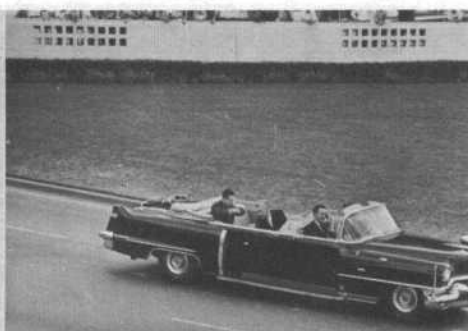
PHOTOGRAPH FROM RE-ENACTMENT