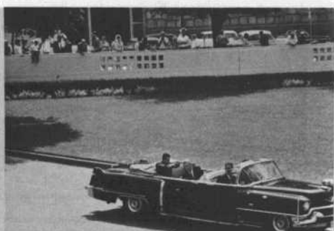
PHOTOGRAPH FROM RE-ENACTMENT