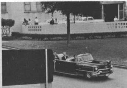
PHOTOGRAPH FROM RE-ENACTMENT