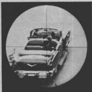
PHOTOGRAPH THROUGH RIFLE SCOPE

DISTANCE TO STATION C ..... 153.8 FT. DISTANCE TO RIFLE IN WINDOW ..... 190.8 FT. ANGLE TO RIFLE IN WINDOW ..... 20°11' DISTANCE TO OVERPASS ..... 334.0 FT. ANGLE TO OVERPASS ..... 0°26'