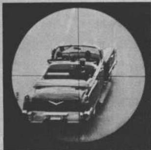
PHOTOGRAPH THROUGH RIFLE SCOPE

DISTANCE TO STATION C ..... 159.0 FT. DISTANCE TO RIFLE IN WINDOW ..... 196.0 FT. ANGLE TO RIFLE IN WINDOW ..... 19°47' DISTANCE TO OVERPASS ..... 329.0 FT. ANGLE TO OVERPASS ..... 0°28'