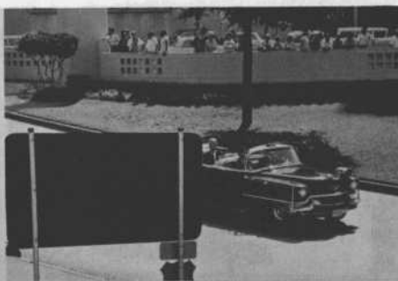
PHOTOGRAPH FROM RE-ENACTMENT