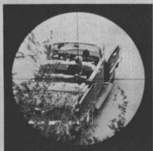
PHOTOGRAPH THROUGH RIFLE SCOPE

DISTANCE TO STATION C ..... 138.9 FT. DISTANCE TO RIFLE IN WINDOW ..... 176.9 FT. ANGLE TO RIFLE IN WINDOW ..... 21°34' DISTANCE TO OVERPASS ..... 348.8 FT. ANGLE TO OVERPASS ..... 0°22'