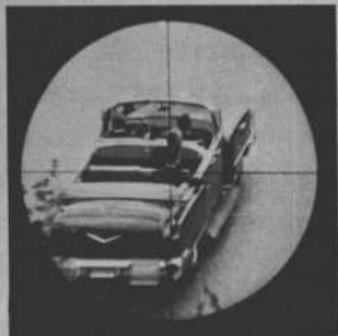
PHOTOGRAPH THROUGH RIFLE SCOPE

DISTANCE TO STATION C ..... 151.4 FT. DISTANCE TO RIFLE IN WINDOW ..... 188.6 FT. ANGLE TO RIFLE IN WINDOW ..... 20°23' DISTANCE TO OVERPASS ..... 336.4 FT. ANGLE TO OVERPASS ..... 0°24'