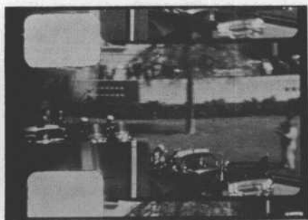
PHOTOGRAPH FROM ZAPRUDER FILM