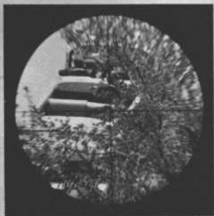
PHOTOGRAPH THROUGH RIFLE SCOPE

DISTANCE TO STATION C ..... 116.3 FT. DISTANCE TO RIFLE IN WINDOW ..... 156.3 FT. ANGLE TO RIFLE IN WINDOW ..... 24°03' DISTANCE TO OVERPASS ..... 371.7 FT. ANGLE TO OVERPASS ..... 0°03'