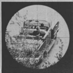
PHOTOGRAPH THROUGH RIFLE SCOPE

DISTANCE TO STATION C ..... 136.6 FT. DISTANCE TO RIFLE IN WINDOW ..... 174.9 FT. ANGLE TO RIFLE IN WINDOW ..... 21°50' DISTANCE TO OVERPASS ..... 350.9 FT. ANGLE TO OVERPASS ..... 0°12'