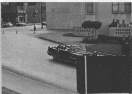
PHOTOGRAPH FROM RE-ENACTMENT