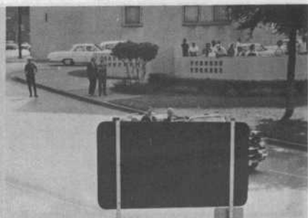
PHOTOGRAPH FROM RE-ENACTMENT