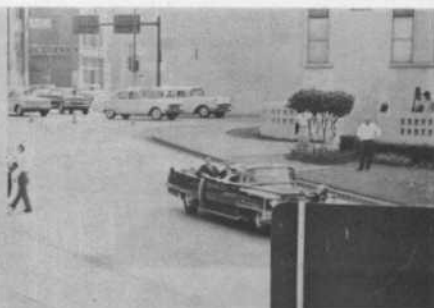
PHOTOGRAPH FROM RE-ENACTMENT