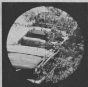
PHOTOGRAPH THROUGH RIFLE SCOPE

DISTANCE TO STATION C ..... 95.6 FT. DISTANCE TO RIFLE IN WINDOW ..... 138.2 FT. ANGLE TO RIFLE IN WINDOW ..... 26°52' DISTANCE TO OVERPASS ..... 391.5 FT. ANGLE TO OVERPASS ..... 0°07'