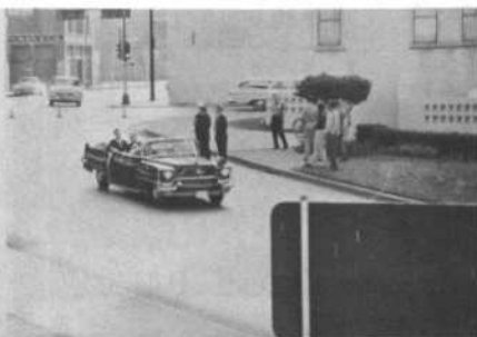
PHOTOGRAPH FROM RE-ENACTMENT