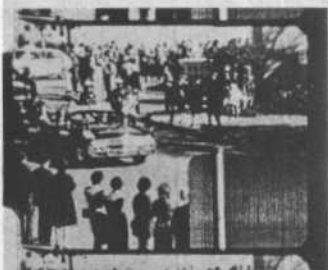
PHOTOGRAPH FROM ZAPRUDER FILM