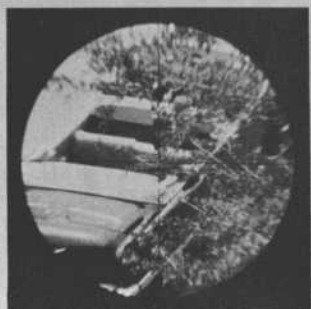
PHOTOGRAPH THROUGH RIFLE SCOPE