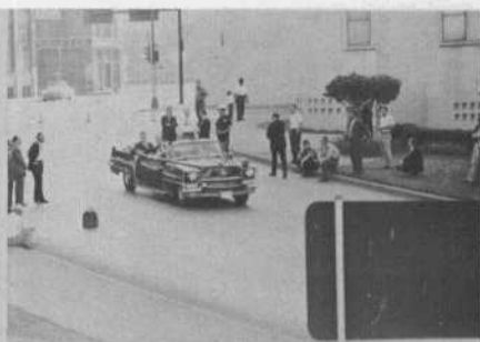
PHOTOGRAPH FROM RE-ENACTMENT