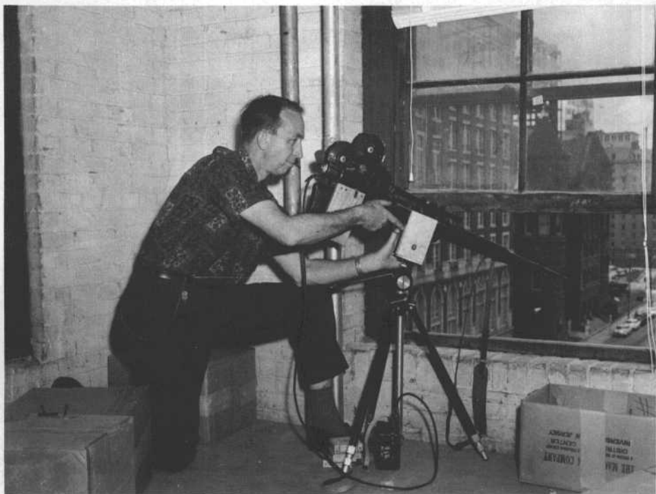
COMMISSION EXHIBIT 887