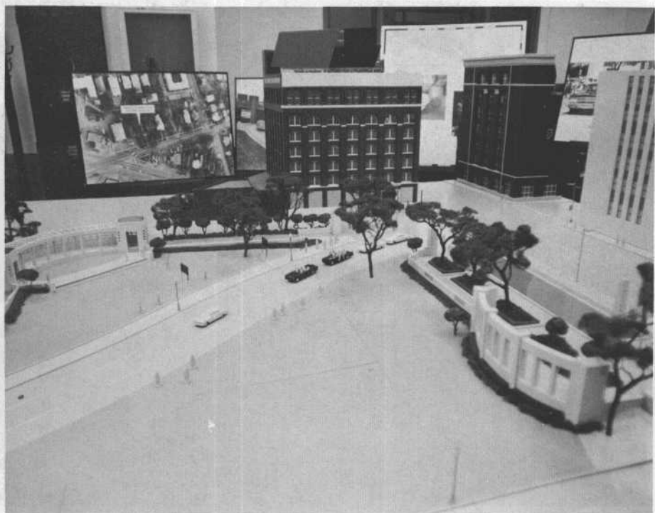
COMMISSION EXHIBIT 878