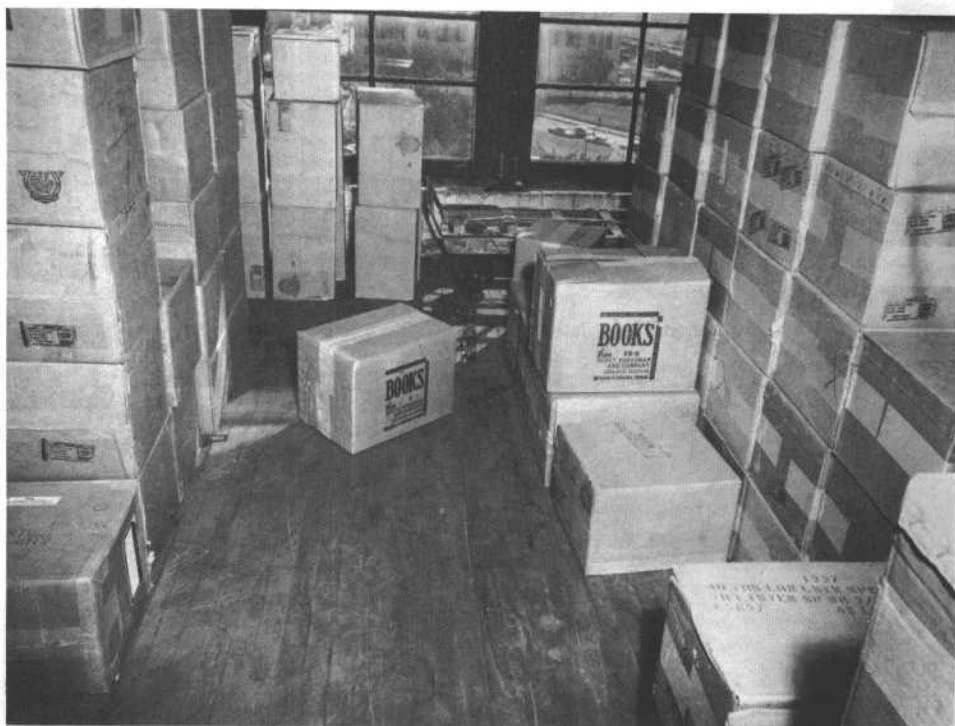
COMMISSION EXHIBIT 728