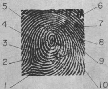
inked right index finger impression Lee Harvey Oswald