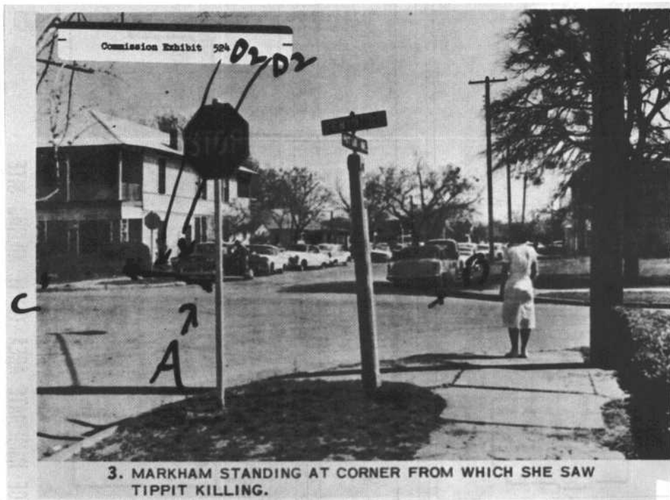
COMMISSION EXHIBIT 524