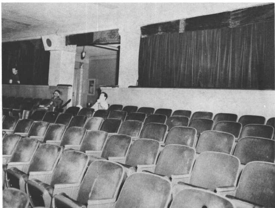
COMMISSION EXHIBIT 519