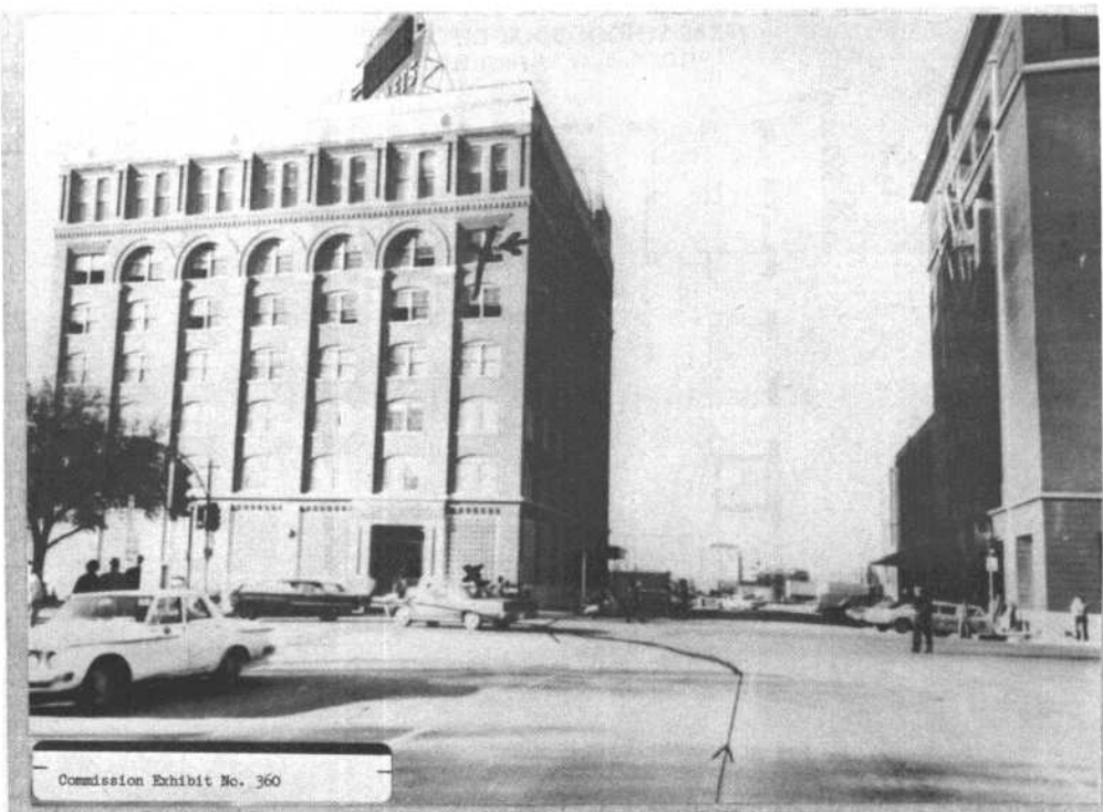
Commission Exhibit No. 360