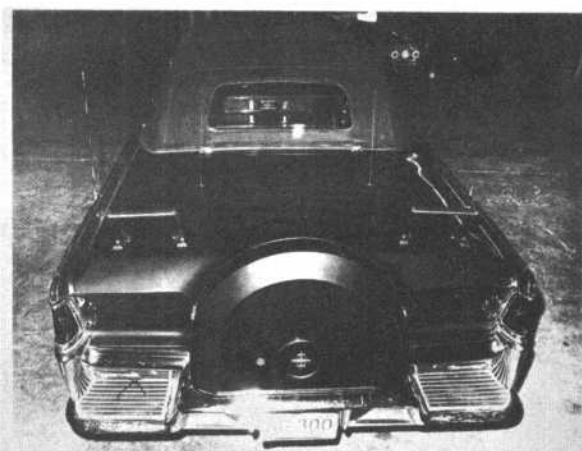
COMMISSION EXHIBIT 345