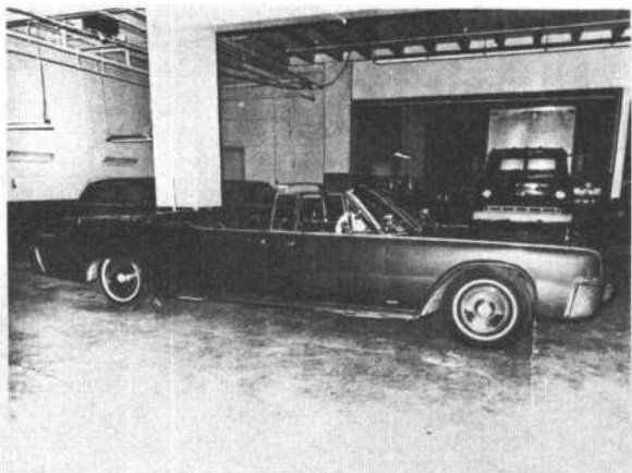
COMMISSION EXHIBIT 344