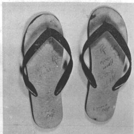
COMMISSION EXHIBIT 148