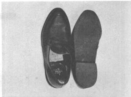
COMMISSION EXHIBIT 147