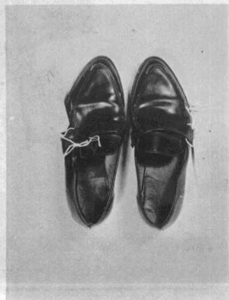
COMMISSION EXHIBIT 149