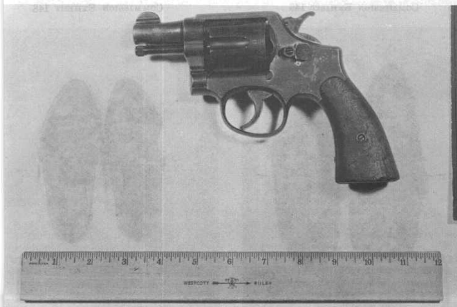
COMMISSION EXHIBIT 143