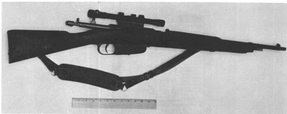
COMMISSION EXHIBIT 139