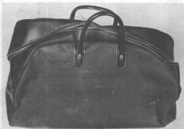
COMMISSION EXHIBIT 126