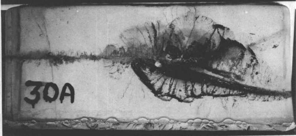
COMMISSION EXHIBIT 845