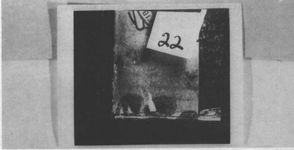
COMMISSION EXHIBIT 660—Continued