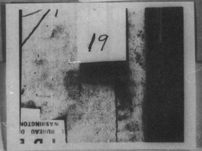
COMMISSION EXHIBIT 660