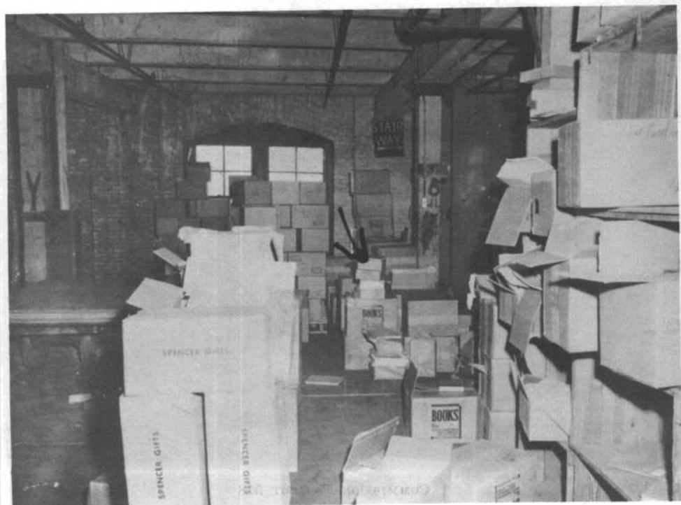
COMMISSION EXHIBIT 516