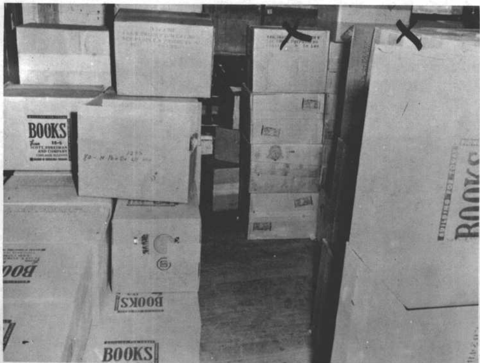
COMMISSION EXHIBIT 513