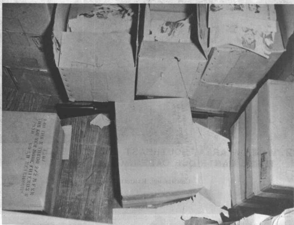
COMMISSION EXHIBIT 514