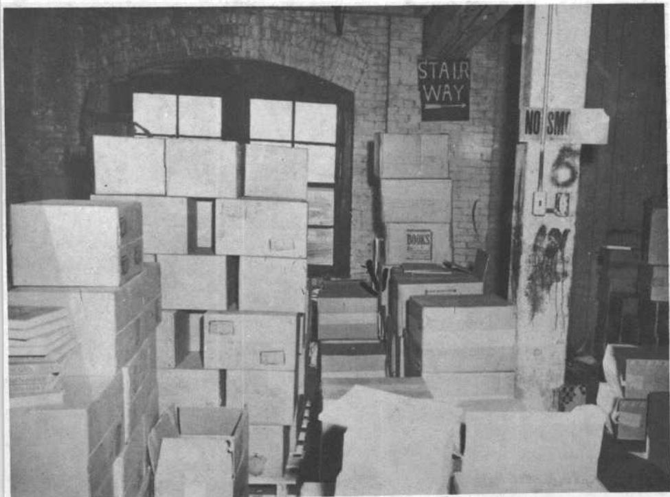
COMMISSION EXHIBIT 515