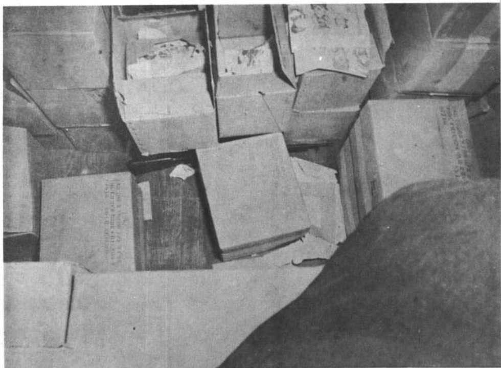
35. POSITION OF RIFLE WHEN DISCOVERED.