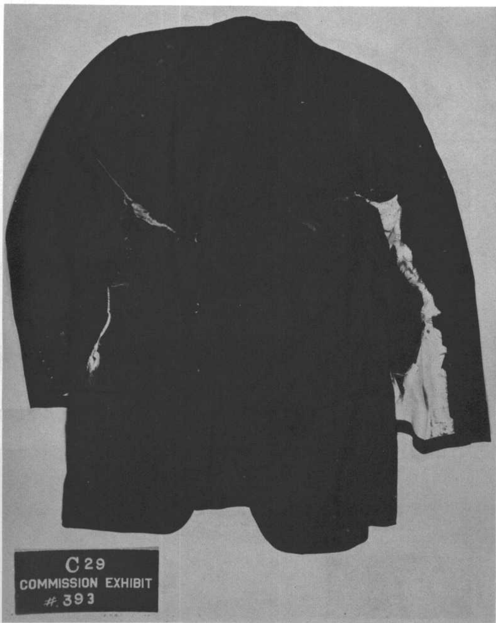
COMMISSION EXHIBIT 393